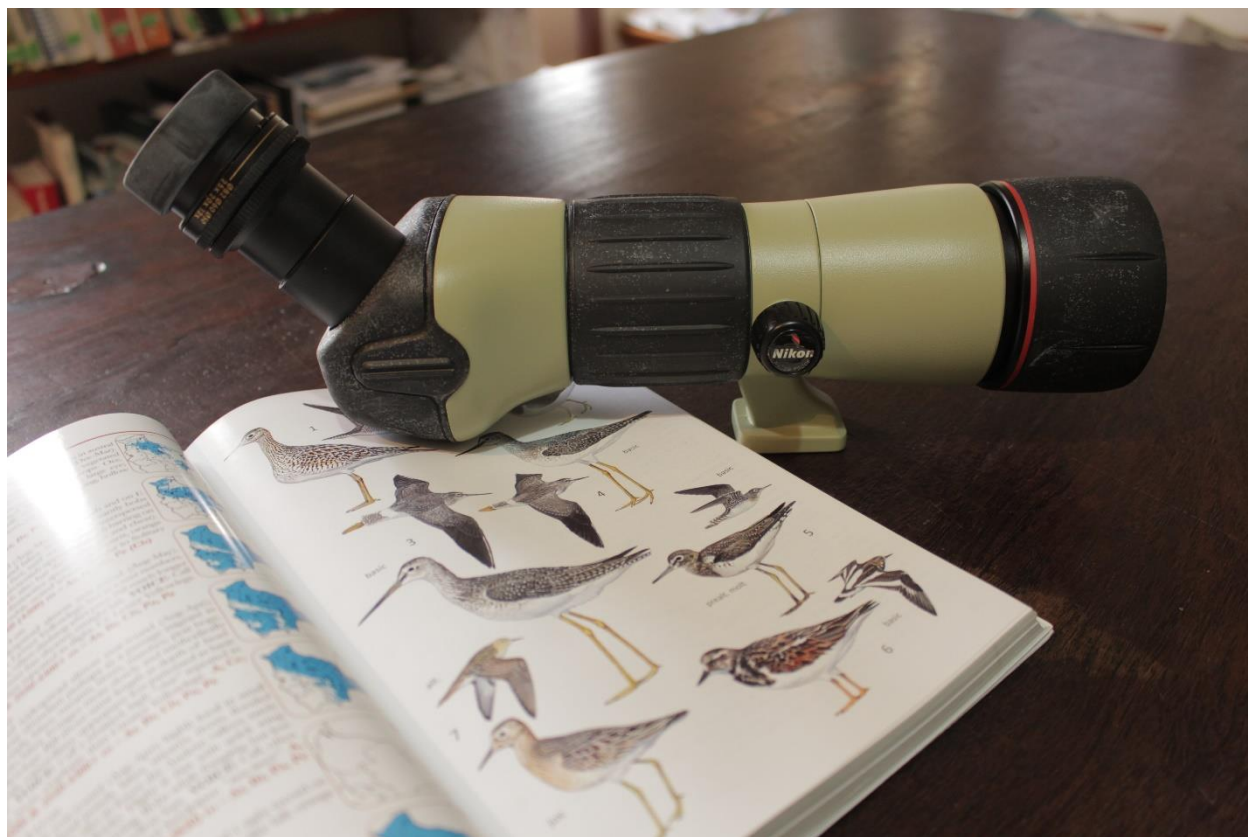
Figure 14. We would really like to thank American Bird Conservancy for the donation of this completely new Nikon telescope for the Barba Azul Nature Reserve. This tool will be used for our annual Buff-breasted Sandpiper monitoring to evaluate the use of critical stopover habitat by these threatened birds.

In the first week of September, Buff-breasted Sandpipers will be monitored throughout the Barba Azul Nature Reserve. A team of local ornithologists from Cochabamba who have several years of experience of surveying sandpipers at Barba Azul will return.