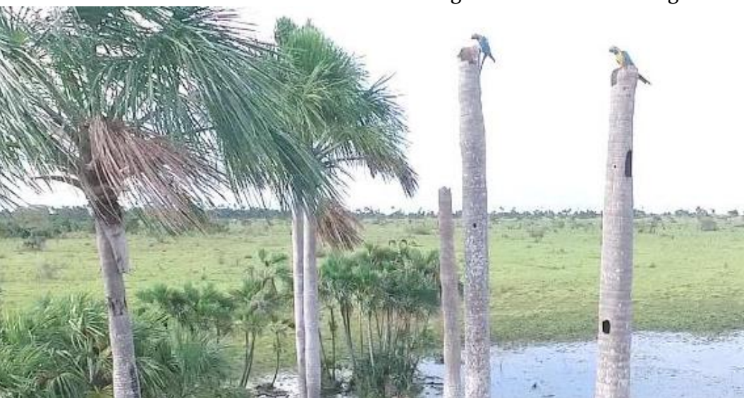
Figure 12. Discovery of breeding Blue-throated Macaws in the flooded savanna of the Llanos de Moxos Bolivia (right dead Mauritia flexuosa snag, upper cavity).

attract Blue-throated Macaws to breed at Barba Azul.