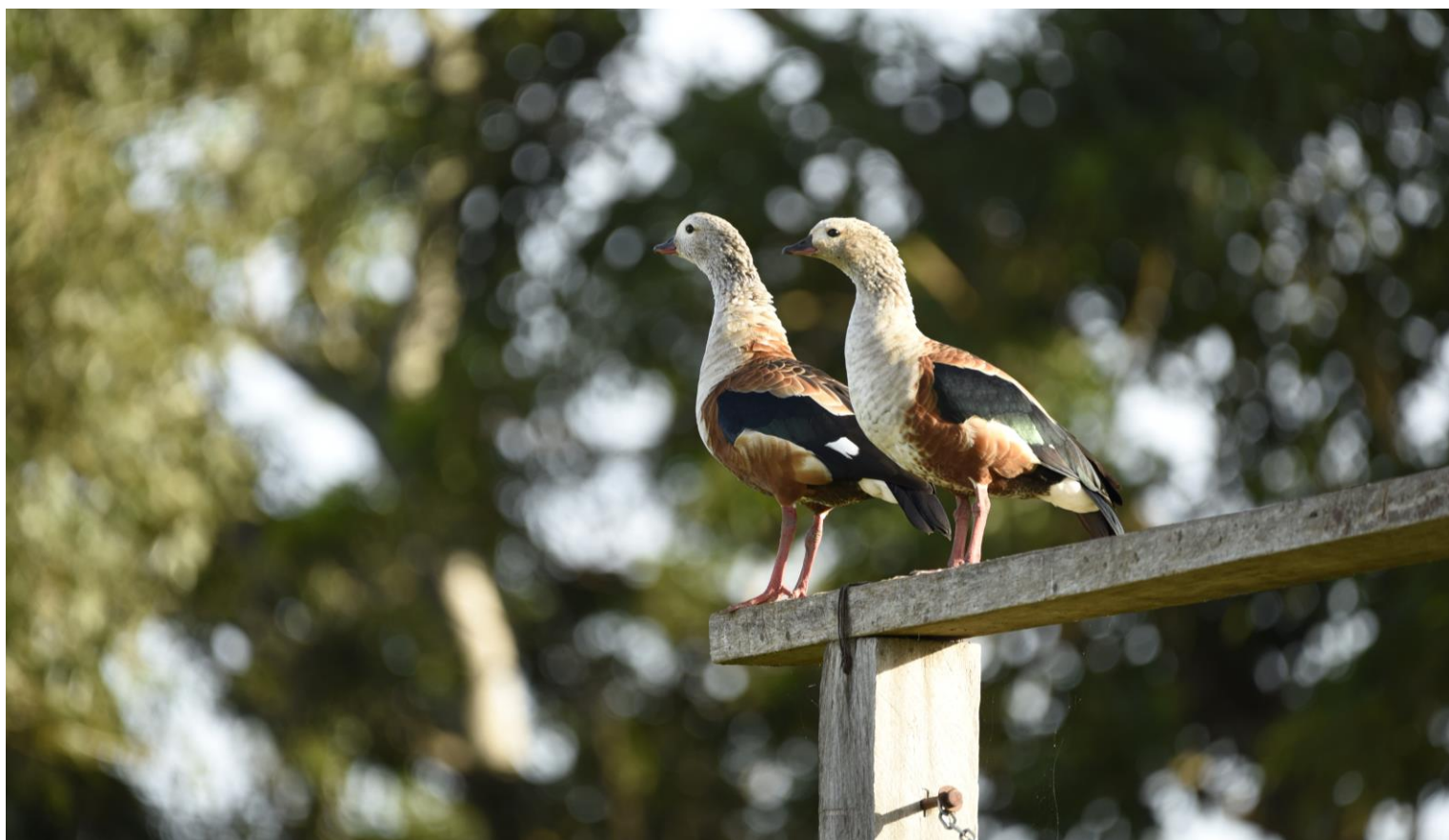
Figure 1. Orinoco Goose ( Neochen jubata ) posing at the Barba Azul field station where they successfully occupy nest boxes especially made for this near threatened species.