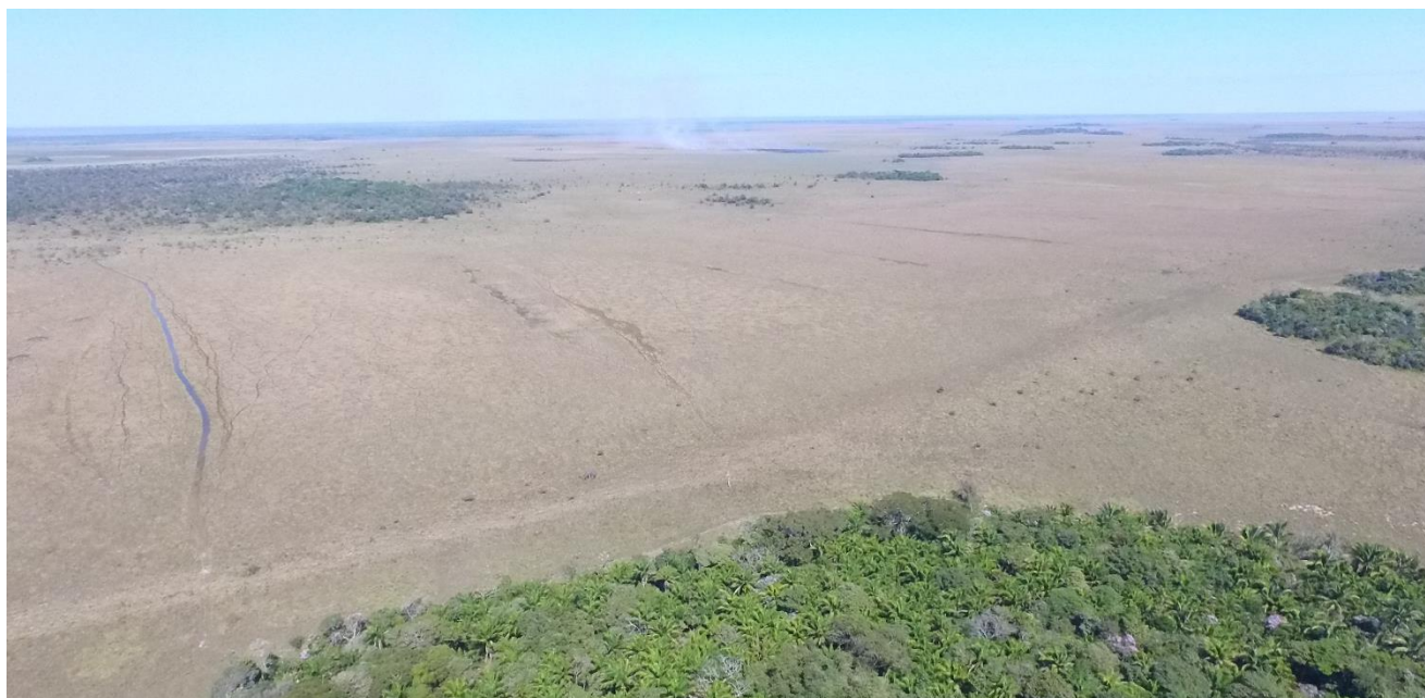
Figure 4. Drone footage of a fire southwest of Barba Azul South. At the field station, this fire looked like it was originated within the reserve's boundaries. With use of the drone, which now becomes an important patrolling tool, we could determine that the fire was in a neighbouring ranch moving in southwards direction, not threatening the reserve.

https://www.facebook.com/armoniabolivia/videos/vb.234034113014/10154735234783015/?type=2&theater