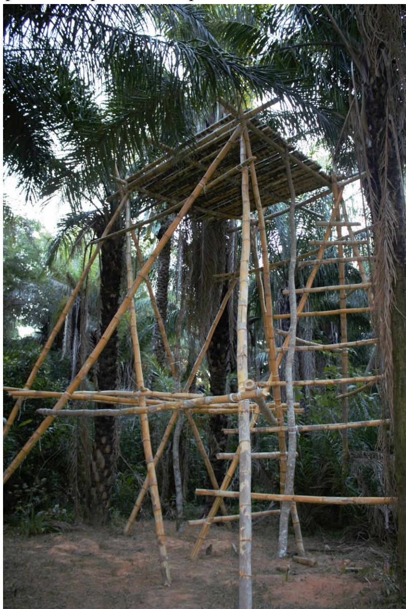
Figure 13. The 8-meter-high platform, fully secured and able to hold 3 people, was build out of local resources from the Barba Azul Nature Reserve. We used the exotic bamboo to not harvest native tree species, and for its durability.

The platform was built completely out of resources from the Barba Azul Nature Reserve. This Large Bamboo is introduced to Bolivia for its durability, the right wood to use to build the platform. Tjalle Boorsma and Marc Meeuwes (reforestation expert from the Netherlands) harvested the Bamboo from Barba Azul south, transported it to Barba Azul North and constructed the platform in 2 days. This sturdy feeding station can hold up to 3 people and a camera trap is positioned to evaluate to foraging activities of the Macaws.