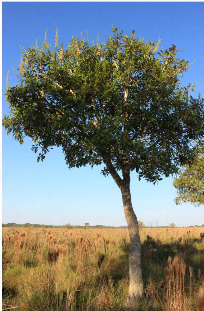
Figure 10. Aliso tree, an abundant fire and flood resistant trees species in the Beni savanna that will be used for the live fencing experiment funded by Wold Land Trust.

This two-year project aims to experiment in planting Aliso trees as fencing posts. A total of 1,000 trees will be planted to provide posts for 10-kilometre border and paddock fencing. A local nursery will be created to start producing Aliso trees that in the future can be sold as fence post to neighbouring ranches, helping the reserve in generating income to pay for management costs.