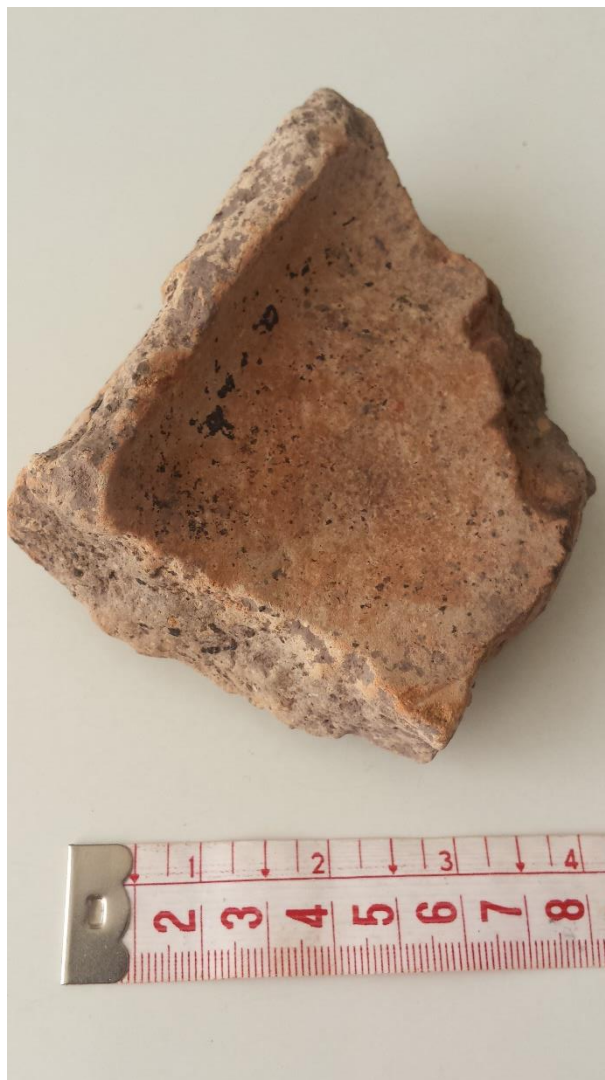
Figure 15. While reforesting forest islands with Motacu palm saplings at the Tiniji area at Barba Azul East in 2016, we discovered parts of ceramics indicating the human origin of these small circular forest islands.

Javier Ruiz-Perez from Spain visited Barba Azul Nature Reserve last year for a short pilot study to evaluate forest islands in the reserve for indicators of human origin. This was a successful pilot study where they found forest islands with over 6 metres of black managed soils. This year they will start an archaeological excavating study on one of these potential forest islands in Barba Azul South to study in detail its origin.