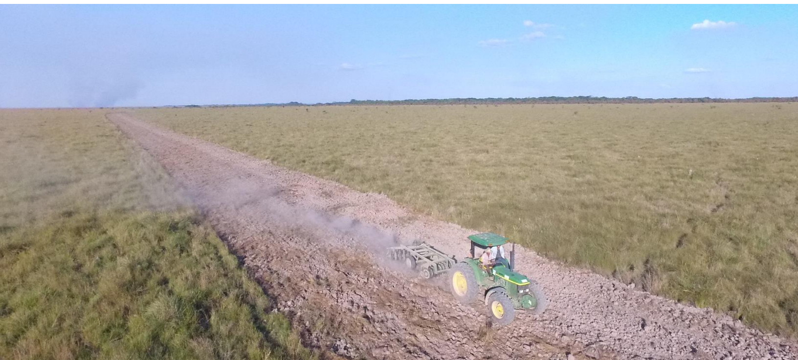
Figure 3. The Barba Azul John Deere tractor improving firebreaks in Barba Azul North. Along the borders of the reserve a smaller parallel firebreak will be established to burn 60 metres of grassland adjacent to the firebreak to lower fuel loads to fully block fires. This is a long-term work plan as building firebreaks is a tedious task and can only be executed in a short window of time when soils are dry. Some areas are inaccessible at the far north of Barba Azul North and different strategies must be undertaken.

There is only a small period during the dry season (July until November) in where firebreaks can be established. In the first 2 months when fires aren't a severe threat yet, most of the lower elevated savannas are still flooded or soil conditions are still too wet. Those areas are located mainly in the north of Barba Azul North are hard to reach. A different approach must be undertaken to ensure fire stops in those areas.