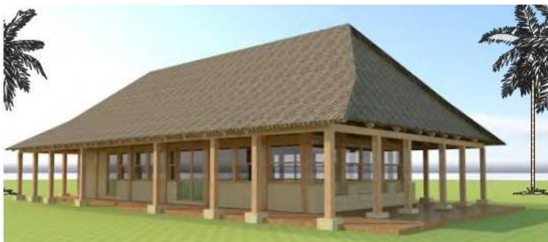
Figure 7. Design of the dining facility to be constructed at Barba Azul Nature Reserve to complete the tourism infrastructure. This dinning facility will overlook at river Omi and surrounding wetlands and marsh habitat.

With the incredible help from International Conservation Fund of Canada and American Bird Conservancy , we can start constructing the Barba Azul dinning facility. The Barba Azul coordinator will start organizing the transportation together with the main contractor at the beginning of August, to ensure all construction material will be present at the reserve. There is a short window of only 4 months where heavy transportation is able to reach the reserve. Construction can then be continued during the rainy season. The funding from ICFC and ABC holds for 70% of the total budget. This is enough to start the construction activities. Armonía will continue to fundraise for the remaining 30% ($ 35.000). We have not been able to raise the funds to improve the cabins.