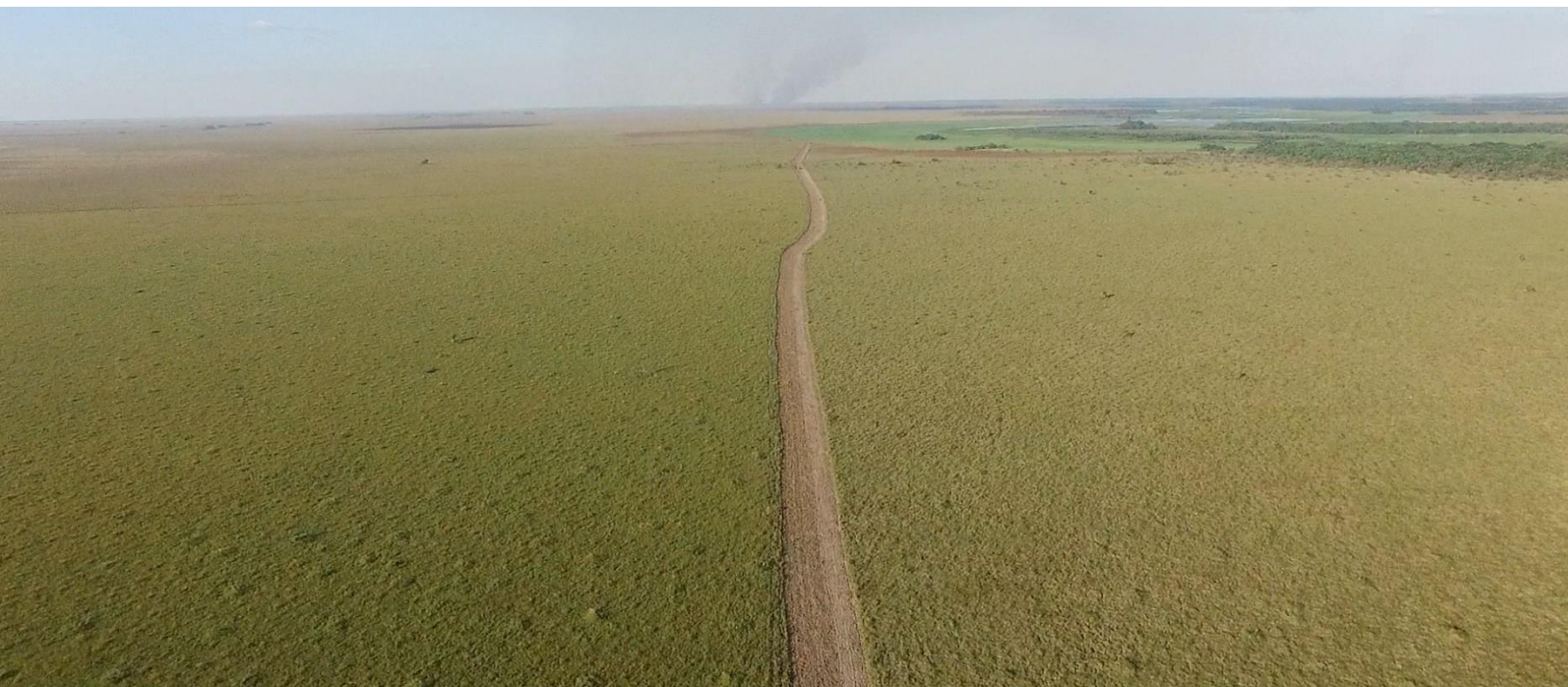
Figure 2. The first and most important firebreaks of Barba Azul North are maintained and improved. Two large firebreaks will prevent man-made fires originating in the north, from burning crucial feeding habitat for Blue-throated Macaws at Isla Barba Azul. Also, new firebreaks have already been established in Barba Azul East. August onwards we would like to maintain and improve firebreaks further north of Barba Azul North (still too wet soil conditions) and maintain the firebreaks of Barba Azul South (waiting for river Omi to drain its water to ensure crossing).

In July, the two main fire breaks protecting crucial habitat for feeding Blue-throated Macaws were finished. Also, new firebreaks have been established in Barba Azul East protecting dry forest habitat and the Barba Azul East infrastructure. Fire breaks further north in Barba Azul North and Barba Azul South will be maintained and improved in August/September.