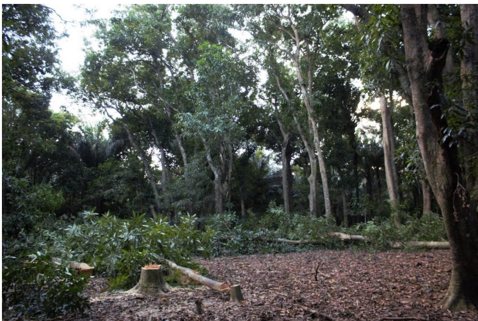
Figure 8 & 9. Tjalle Boorsma is improving Motacu habitat by creating gaps within the exotic Mango stands where the trees are felled directionally and timber is used for maintenance purposes.

Part of the World Land Trust supported Motacu protection program for Barba Azul South, is the improvement of habitat for the Motacu palm, the most important foraging species for the Blue-throated Macaw. This part of the reserve has several large Mango forests that are exotic to Bolivia. The undergrowth of these forest patches is deprived of all regeneration of native tree species. Mainly light and water competition are the driving factors behind the prevention of other trees to grow in these patches. To improve Motacu habitat, large gaps were created by removing the large exotic Mango trees. These gaps have sufficient light for Motacu trees to regenerate naturally. Also, Motacu seedlings will be planted in these gaps to favour this species in these forests. The timber of the Mango trees will be used to build furniture for sofas at resting sites along trails, tables for the cabins and a base structure to repair an old trailer within the reserve. The sustainable logging of this timbre is not only improving habitat conditions, it also saves high maintenance costs and the purchase of a new trailer (800 USD).