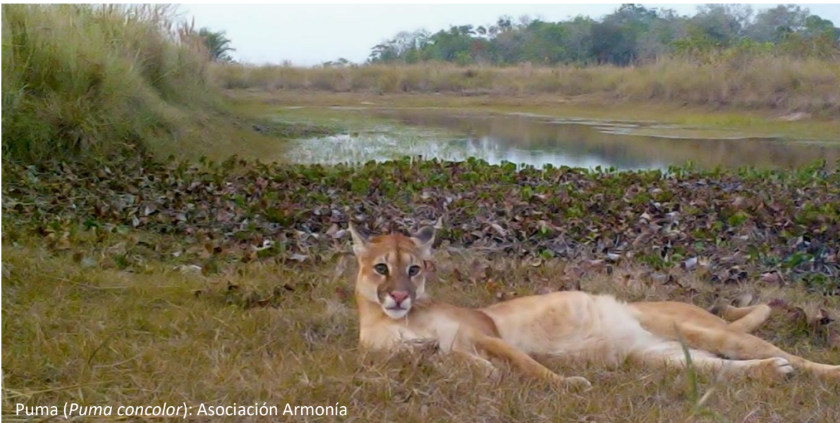
Puma ( Puma concolor ): Asociación Armonía

The reserve is also a safe haven for Jaguars, Pumas, Maned Wolves, Ocelots, Giant Anteaters and Black Howler Monkeys to name just a few of the impressive mammal species that are found here. Mornings at Barba Azul are usually highlighted with the incredible wake-up calls from the Black Howler Monkeys, making it a true wild experience.